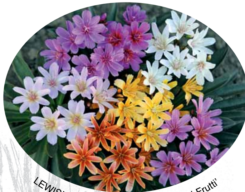
LEWISIA Longipetala-Hybr. "Little Tutti Frutti"

Jelitto STAUDENSAMEN · PERENNIAL SEEDS · GRAINES DE PLANTES VIVACES Production · Breeding · Seed Technology