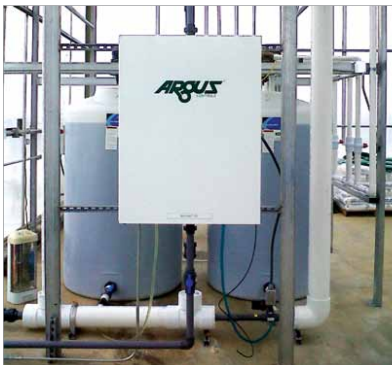
A typical A/B in-line injection system using two stock tanks.

are continuously injected into the water stream as irrigation events are underway. Mixing usually occurs in the downstream section of the irrigation pipe or in a small mixing tank depending on the injector design. Injection volumes are based on system flow rates, EC/pH sensor feedback or a combination of the two.