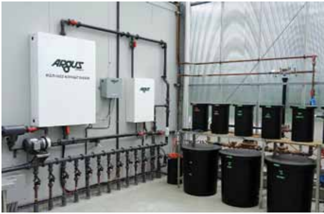
A single-element nutrient dosing system.

sense from a management perspective since you generally want to optimize water management and nutrient levels. This process of managing both is often referred to as 'fertigation'. When fertigation control is also integrated with your environmental control system it can be easier to monitor and manage everything from a single interface.